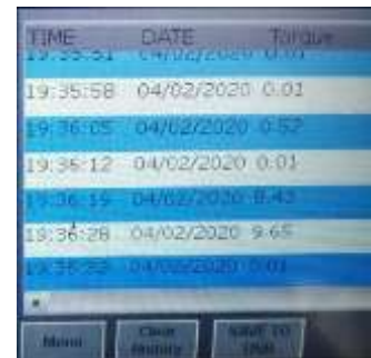
USB Data Report